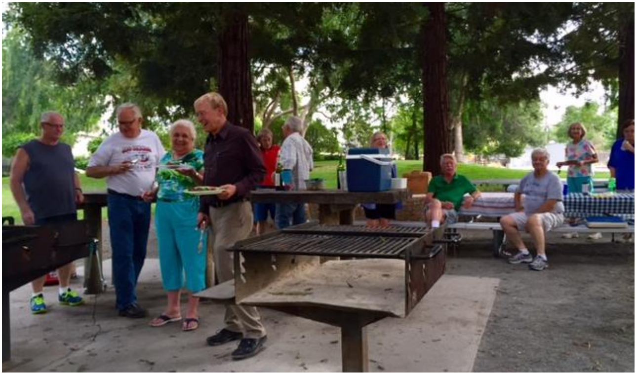
F q p ø vShowchasers BBQ the first Wednesday of the month during summer