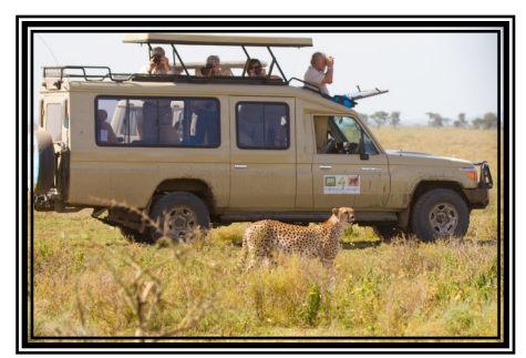
Safari Cruiser with Cheetah